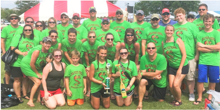
Praying for the Finish Line in 2017

The 7th annual River Cities Dragon Boat Festival will be June 14 -15 at Lake Willastein, Maumelle, and for the third year in a row, FUMC Sheridan will be represented by team Praying For the Finish Line! It's the perfect family-friendly event with not only boat races, but tailgate parties, food trucks, DJ, and a children's area with arts and crafts.